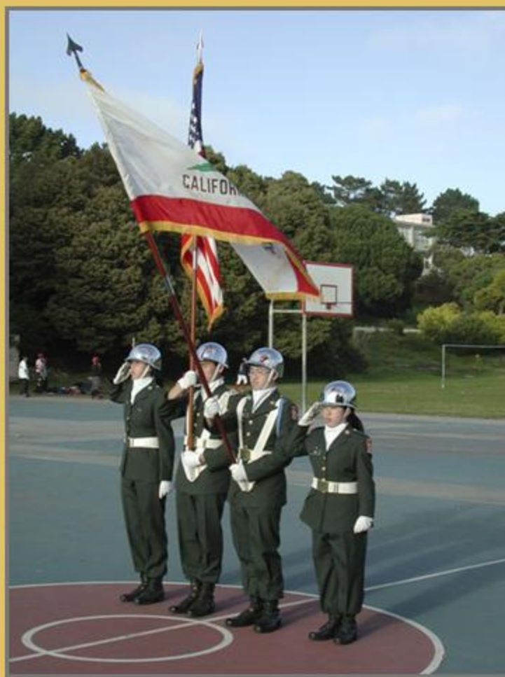
Color guards add a ceremonial atmosphere to community events and bring prestige to their schools.

Solid Citizens. JROTC goes well beyond the classroom. By providing many opportunities to participate in community events and to volunteer for community services, it leads cadets to a practical understanding of how to be good citizens.